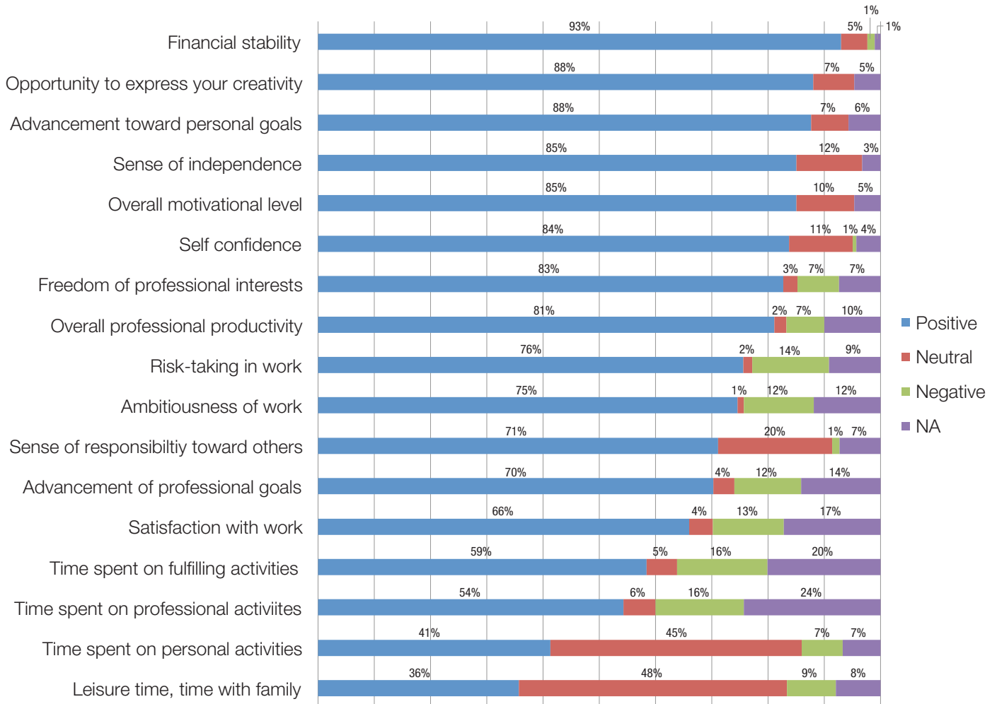
FIGURE 1. FELLOWS' PERCEPTIONS OF THE IMPACT OF THE FELLOWSHIP

The assessment did not attempt to catalogue the post-award accomplishments of individual Fellows or to measure directly the impact of the Fellowship on a specific discipline. Fellows perceive the Fellowship as having the potential to draw attention to a Fellow’s area of work, especially in smaller and nascent fields.