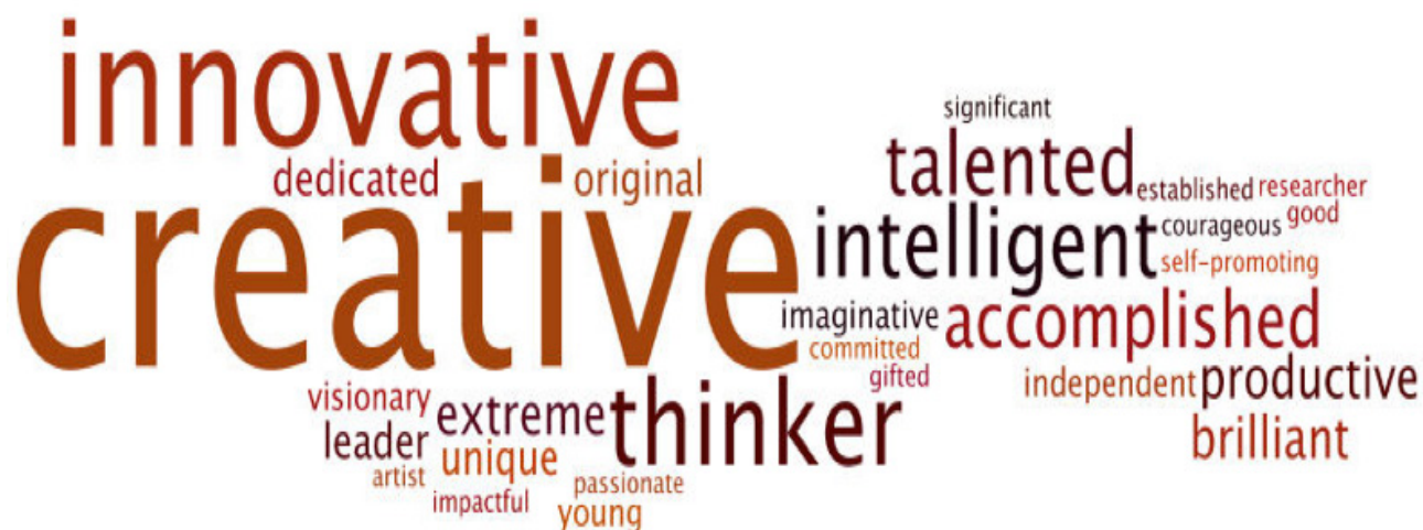
FIGURE 2. PEERS’ PERCEPTIONS OF FELLOWS

Fellows’ peers regard Fellows first and foremost as creative and innovative. They see the Fellowship as distinctive because it prioritizes potential over achievement, compared with other prestigious awards. Simultaneously, they report admiration toward Fellows and their work; however, they are less likely than the engaged public to suggest that the Fellowship has inspired their own pursuit of creative ideas. Figure 2 illustrates the words most associated with Fellows by their peers (words displayed with larger images were more frequently noted).